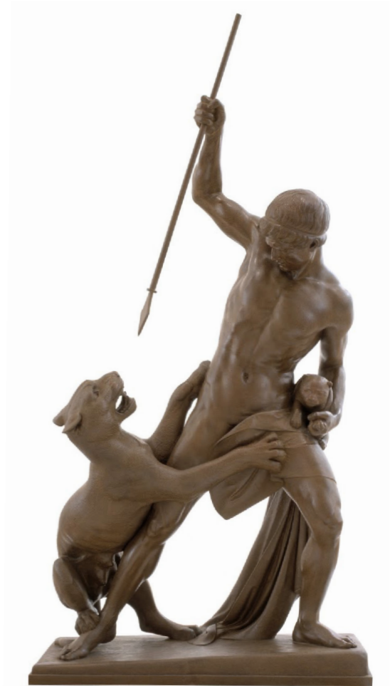
3 J. A. Jerichau, The Panther Hunter , 1846. Bronze, 209 x 105 x 65 cm. Statens Museum for Kunst, Copenhagen.